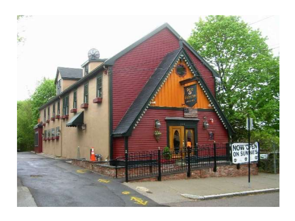
344-346 Elliot St.