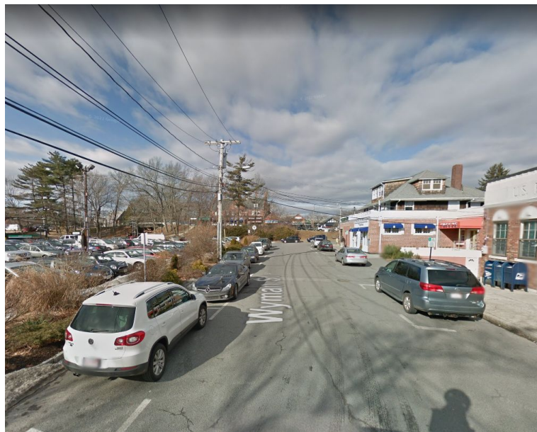
2. Wyman St at Waban T parking lot