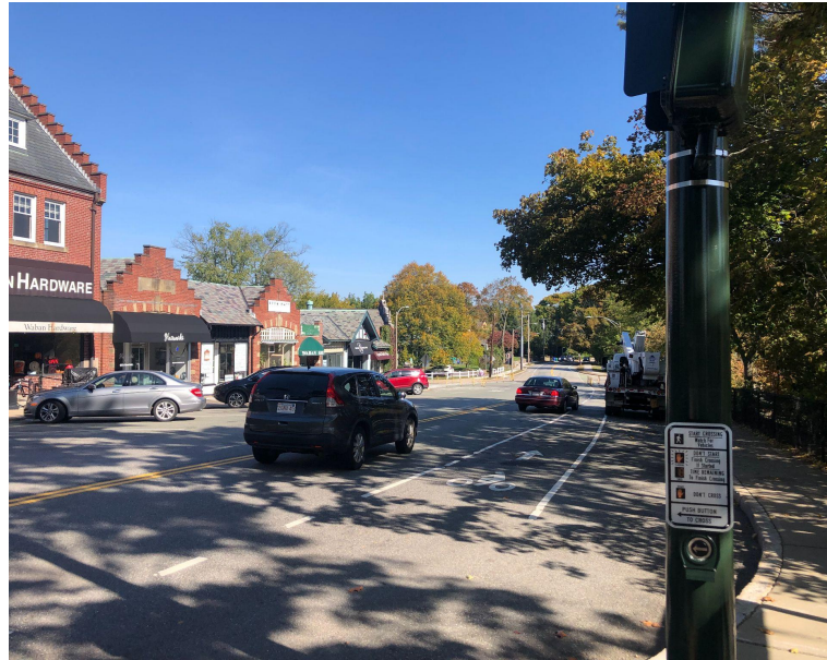
1. View down Beacon St looking east