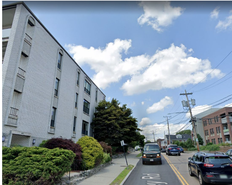
1. View down Langley Rd looking north