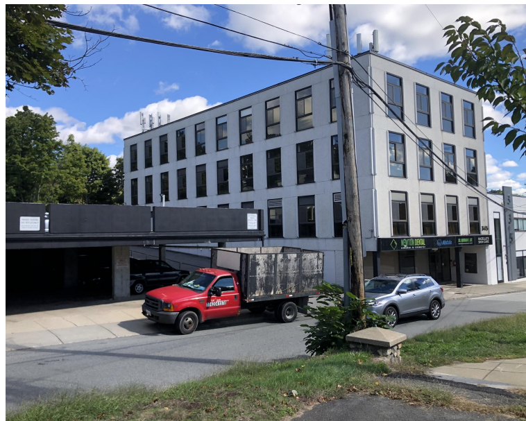
2. View down Jackson St at Route 9