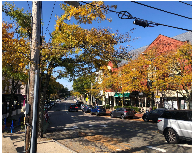
1. Lincoln St at Walnut St intersection