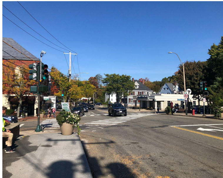
2. View down Walnut St looking north