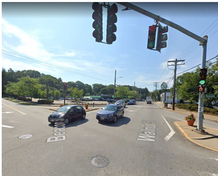
2. Walnut St and Beacon St intersection