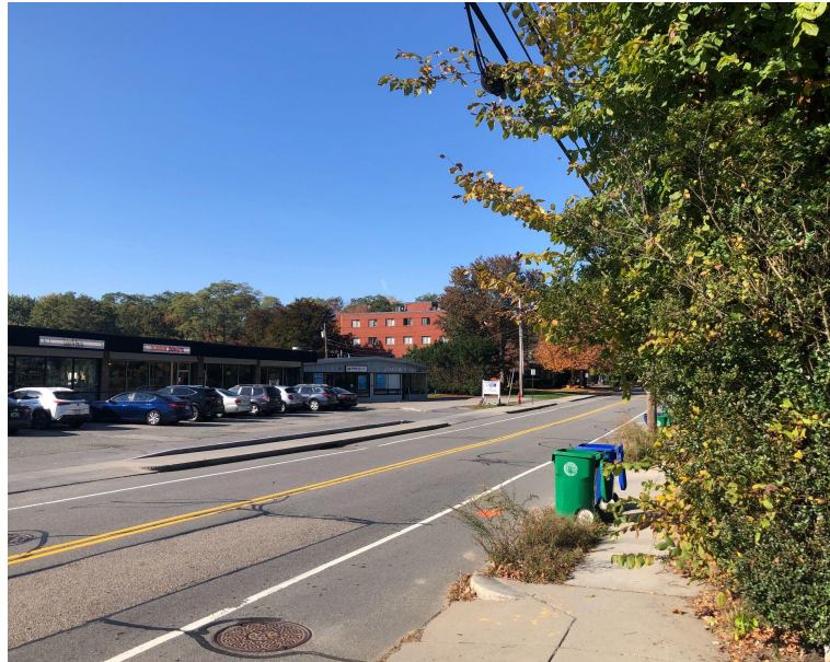
1. View down Beacon St looking west