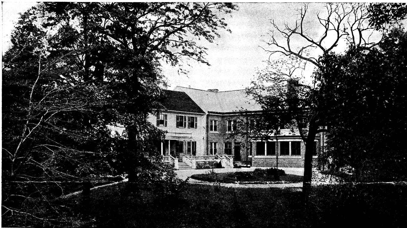
OLD HOME AND NEW EAST WING — SOUTH WEST VIEW

We have full confidence that the citizens of Newton will provide all that is necessary for this work when they realize the pressing need. There is a long waiting list of people who desire to enter the Home. Many of the cases are most pathetic. The applicants in their old age, through unfortunate circumstances, are for the most part helpless and dependent upon others, and all are too old to support themselves.